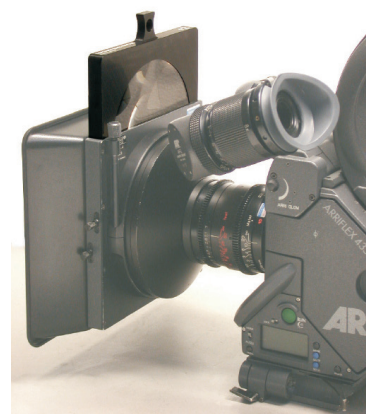
Vantage Slide Diopter +1 used with an ARRI LMB-4