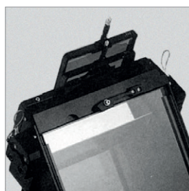
Easy access dual filter slots.

Century's Super Wide Angle Prism sits only 0.25" off the surface which permits a point of view less than 2.5" from the floor or ceiling.