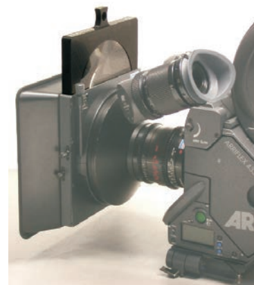
Vantage Slide Diopter +1 used with an ARRI MB-14