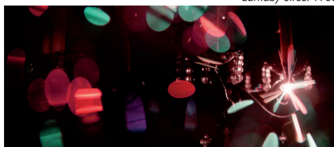
Las Vegas 5am

Original frame grabs. Shot with Hawk 45-90mm/T2.8 1.3x Squeeze Front Anamorphic Zoom Lens, Arri Alexa Plus 4:3 and Xenon Flashlight.