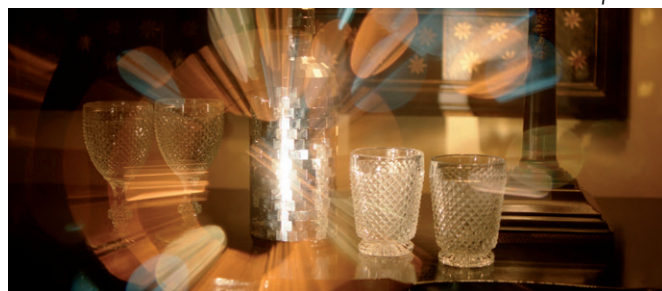
Carnaby Street 1968