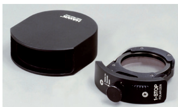
The rotatable Polarizer is available as True Pol or 1-Stop Pola It has a locking mechanism and can be set by hand or motor.