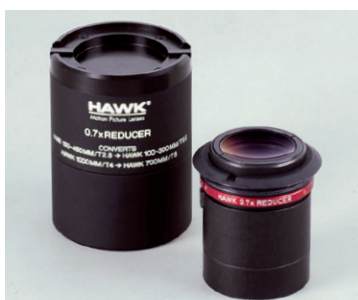
The Hawk 0.7x Reducer can be easily attached on location.

If you take the 150-450 mm on location, you also take the world's fastest 100-300 mm zoom – both of them designed to help you get the best images.